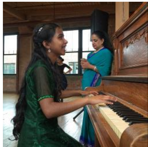
EYE On India Gala fundraiser event on June 9, 2016